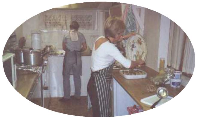
Our Caterers Preparing Dinner