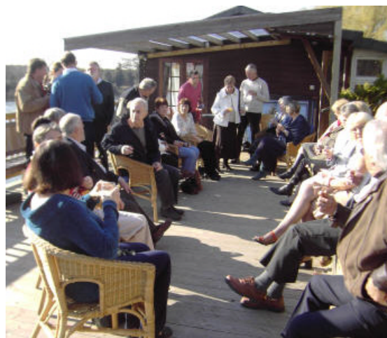
Glorious weather for Ladies Day